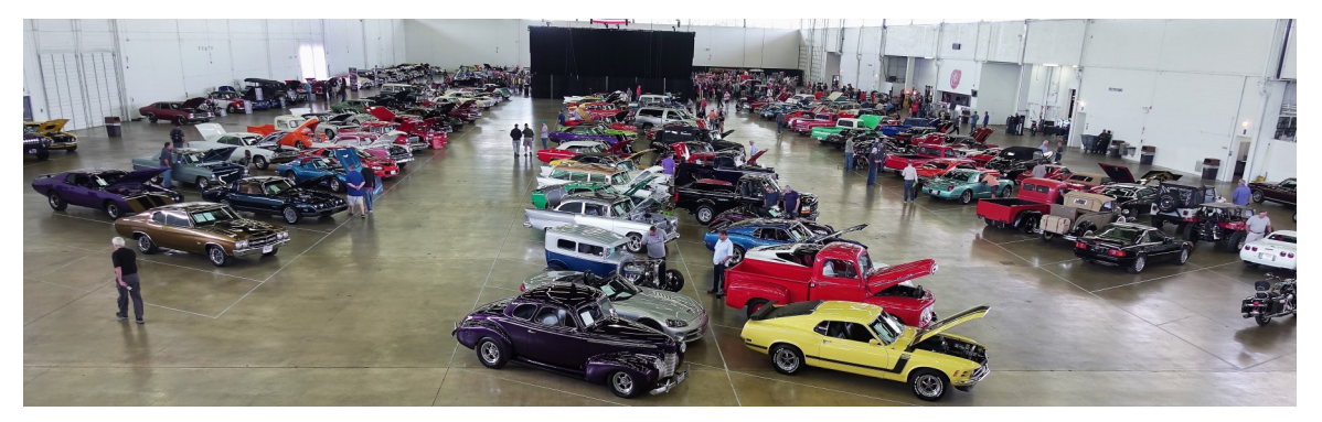
Here is just a portion of the almost 500 cars being auctioned this weekend.

The auction halls had more than just Cadillacs. There were cars of many years and many makes and all were highly shined up and ready for the auctioneer's hammer.